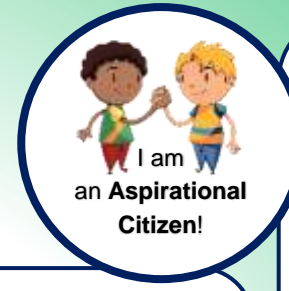
I am an Aspirational Citizen!