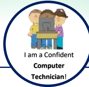
I am a Confident Computer Technician!