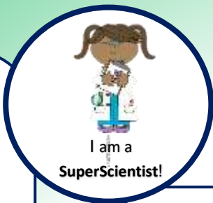
I am a SuperScientist!

Recognise and name some everyday materials/Name objects and the materials they are made from/Sort materials according to their properties/Conduct a simple test to find the best material for a purpose.