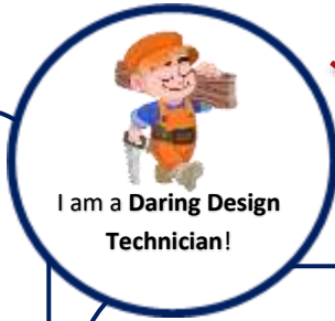
I am a Daring Design Technician!

Make a puppet. Choose the correct tools and materials. Evaluate my work in order to improve it.