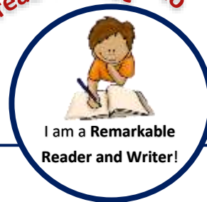
I am a Remarkable Reader and Writer!