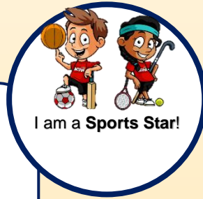
I am a Sports Star!