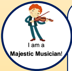
I am a Majestic Musician!

What Am I Learning? To use my voice confidently in different ways. To recognise how sounds can be made and changed. To Choose five animals to represent using vocal and instrumental sounds.