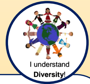
I understand Diversity!

I can: Change my voice to make different sounds and know how sounds can be changed. I can compose a piece of music using my voice and different instruments with confidence.