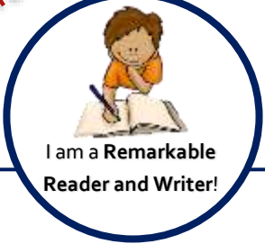
I am a Remarkable Reader and Writer!