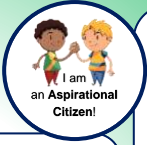
I am an Aspirational Citizen!