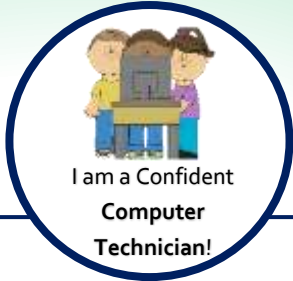
I am a Confident Computer Technician!