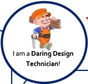
I am a Daring Design Technician!

Make a puppet. Choose the correct tools and materials. Evaluate my work in order to improve it.