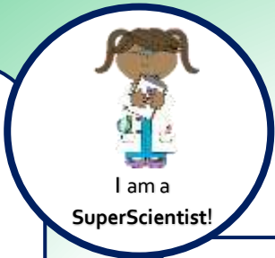
I am a SuperScientist!

Recognise and name some everyday materials/Name objects and the materials they are made from/Sort materials according to their properties/Conduct a simple test to find the best material for a purpose.