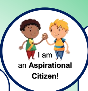
I am an Aspirational Citizen!