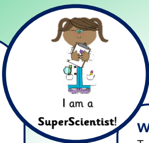
I am a SuperScientist!

Recognise and name some everyday materials/Name objects and the materials they are made from/Sort materials according to their properties/Conduct a simple test to find the best material for a purpose.