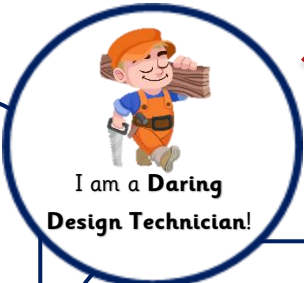
I am a Daring Design Technician!