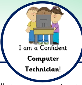
I am a Confident Computer Technician!