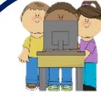
I am a Confident Computer Technician!