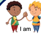
I am an Aspirational Citizen!

Use the internet to research images of celebration cards / Log on, find a document in a folder, edit and save it /Use 2Simple Paint software (see Art)