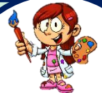
I am an Amazing Artist & Designer!

I can predict what might happen in the story/ I can write simple sentences or phrases and confidently use fingers spaces, full stops and capital letters/ I can describe the characters and key events of a story/ I can write a diary entry to explain how the character might be feeling/ I can describe my favourite part of the story and write a sequel to the story/ I can write down what the characters might be saying/ I can create a poster/ I can retell the story/ I can self-assess my own work by ticking off the skills used from a checklist.