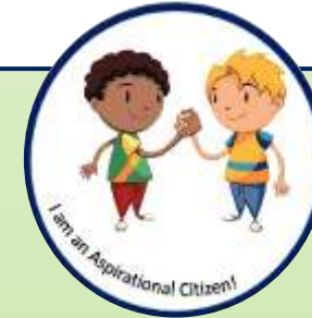
I am an Aspirational Citizen!

Describe the location of India using geographical language / identify a physical feature / identify a human feature / compare physical features / compare human features.