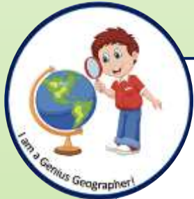
I am a Genius Geographer!

Take responsibility for my own actions / Recognise how my behaviour influences others both positively and negatively / Listen to, reflect on and respect other people's views and feelings / Understand who can help if someone is affected by bullying / Recognise that there are people who care for and look after me / Consider the different types of teasing and bullying / Understand that bullying is wrong and know how to get help to deal with bullying / Seek help from an appropriate adult when necessary / Understand that family and friends should care for each other / Learn strategies to cope with unfair teasing / Understand that there are different types of teasing / Understand the role of the local community / Consider ways of looking after the school or community / Suggest rules that would improve things for the common good.