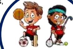
I am a Sports Star!

Repeat a short motif, move confidently at different heights, turn at different speeds and show expression.