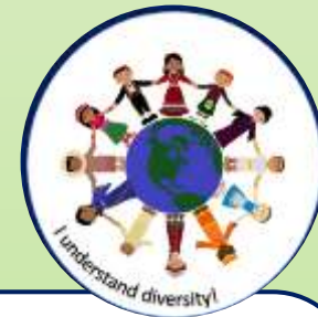
I understand diversity!