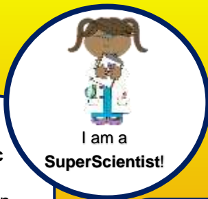
I am a SuperScientist!