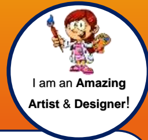
I am an Amazing Artist & Designer!

Identify ways to stay safe / Show fairness and share with others / Develop relationships with others who are different