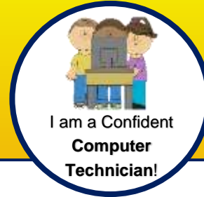
I am a Confident Computer Technician!

Explain the effectiveness of a material / Make skilled predictions / Manipulate materials / Test materials for a purpose / Classify materials for suitability