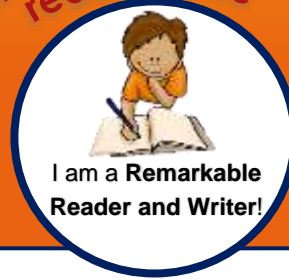
I am a Remarkable Reader and Writer!