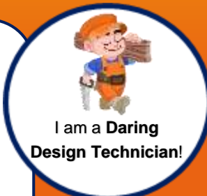
I am a Daring Design Technician!

Plan ahead to develop my ideas / Use the correct tools and media / Evaluate my work in order to improve further