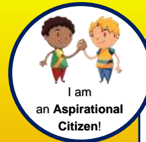
I am an Aspirational Citizen!

Develop a program and debug when required / Test a program for accuracy / Set and follow instructions / Stay safe when using technology